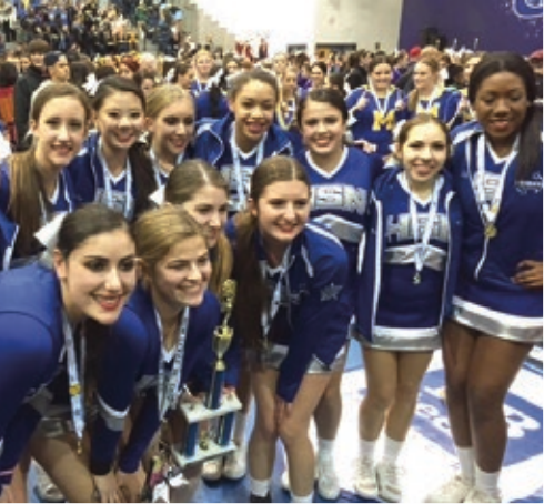
▲The High School North cheerleaders placed Second in their division at the Northeast Regional Cheerleading Championship this year and earned a bid to the National Competition. These young women have great skill with timing, balance, and coordination, and know the value of teamwork.

▼Music is a creative art form that allows use of the whole brain and promotes self expression through performance. Students develop musical abilities in ensemble settings, providing students with skills that encourage lifelong learning. Village School students practice for concerts.