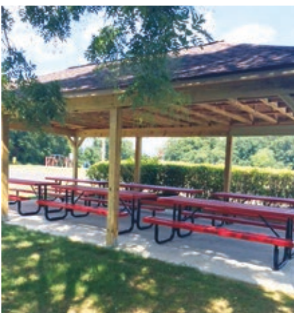
The Millstone River School Pavilion is a new outdoor classroom used by teachers and students throughout the school year. This now-completed three-year project gives students an opportunity to enjoy and experience nature, along with a space that motivates and engages children in a vibrant setting.