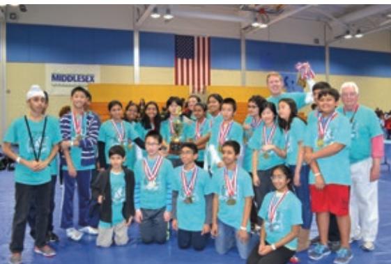
The Community Middle School Science Olympiad Team once again was named the New Jersey State Champion. This honor marks the 15th consecutive year that CMS has won the New Jersey Science Olympiad Competition. The team also competed in the National Tournament.