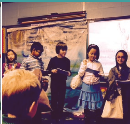
Grade 3 students at Maurice Hawk Elementary School celebrated their cultural heritage by presenting an immigration play and sharing a potluck luncheon. Students learned to appreciate the cultural contributions that immigrants made to America while learning more about their own history.