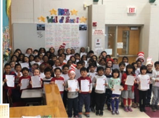
▲Town Center Elementary School Extended Day Program students participated in a Reading Challenge: reading almost 6,000 books. The program was designed to give students an opportunity to use reading to expand their imagination and enhance literacy skills. Students kept logs to document the books read.

▼Music is a creative art form that allows use of the whole brain and promotes self expression through performance. Students develop musical abilities in ensemble settings, providing students with skills that encourage lifelong learning. Village School students practice for concerts.