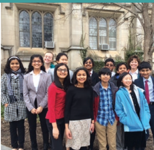
Grover Middle School students won accolades at National History Day using the theme: Exploration, Encounter, Exchange in History. The National History Day competition offers students the opportunity to develop a greater understanding and perspective about historical events.

Residents of Plainsboro and West Windsor Townships are served by cable television channels on the Comcast and Verizon networks. Plainsboro residents have two channels: Channel 26 (Comcast) and Channel 26 (Verizon). West Windsor residents have three channels: Channel 27 (Comcast) and Channels 40 and 42 (Verizon). Check out the Bulletin Board for upcoming school events and watch school programs.