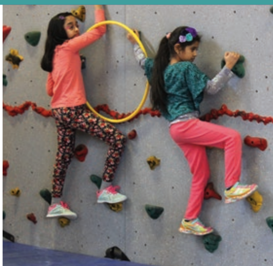
The fundamental basis for the Physical Education program is to develop positive attitudes and values regarding physical well-being. Students from Wicoff Elementary School participated in a gym unit for the K-3 Physical Education program and had the opportunity to use a rock climbing wall.