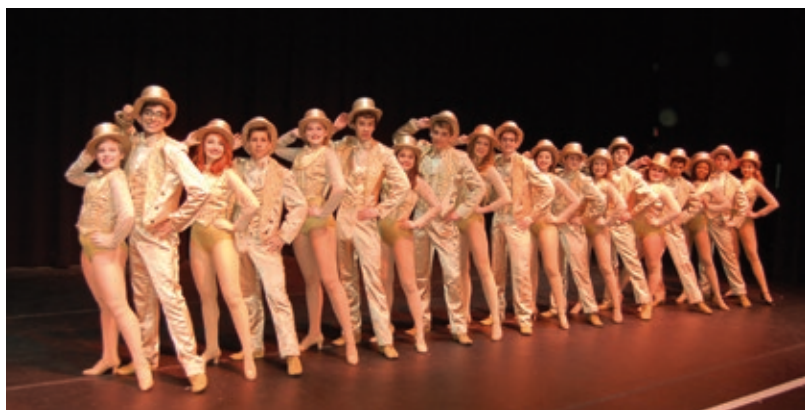
They were a singular sensation. These are the students who performed in the High School South spring musical, A Chorus Line. HSS students worked tirelessly to present this musical (the longest running show on Broadway), with a full student stage crew and musical accompaniment.

While not 100 percent green, WW-P is doing its share of not using paper. To accomplish this, we place flyers, program events, and calendar items on the WW-P Virtual Backpack. Items are listed by month under three categories: Community Activities, School Events, and Sports Programs. Link: http://www.ww-p.org/new_s_r_o_m/community_news