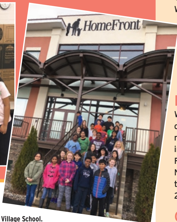
Village School. The Wolf Walk brought together students, staff, and family members to celebrate the charitable work of Village School; almost $5,000 was raised to help those in need. The year of community service culminated with a Day of Service.