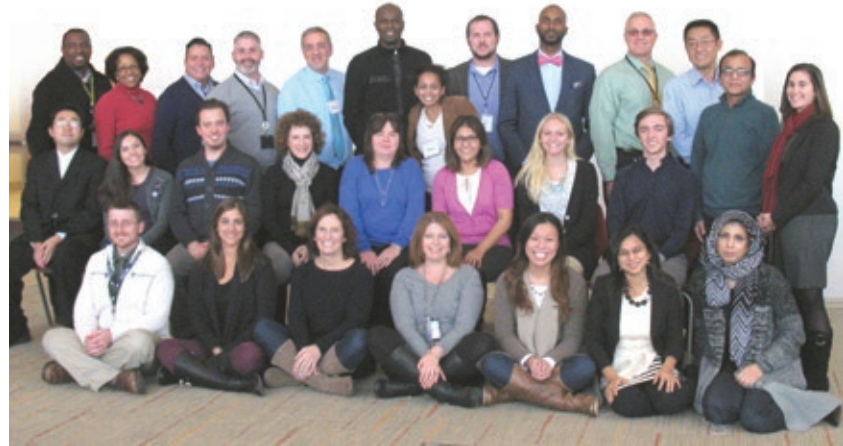
Strategic Planning Core Team