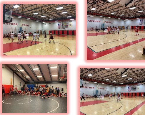
Our winter sports groups are finishing-up their exciting seasons in basketball, wrestling, and cheerleading. Proud of our Panther student athletes!