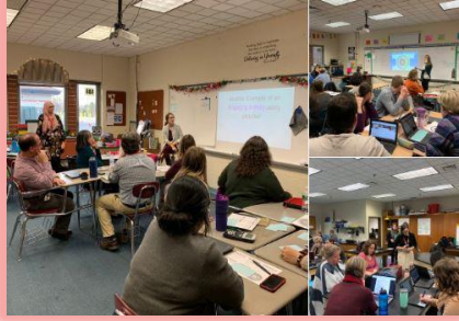
Staff have continued to work on bringing district strategic goals to life throughout classrooms at CMS.

It is hard to believe, but we are just passed the half-way point of the 2018-19 School Year. December and January saw us leave 2018 with Spirit Week and Pep Rallies , and enter the new year with even more fun in store for TEAM CommUNITY! We hope you enjoy this snapshot of the accomplishments over the last two months, and keep in mind the pictures below are just a few examples of the middle school experiences we hope all students will continue to enjoy as we enter Marking Period 3 . For even more happenings at CMS, please follow us on Twitter . See below for details! As always, our Daily Announcements can help you stay aware of all of the latest and greatest at CMS. Enjoy the highlights below, and thanks for your support .