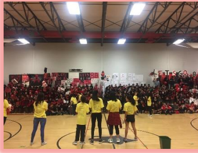
Student Council ran incredible Pep Rallies for all CMS grade levels. A really fun way to end 2018!