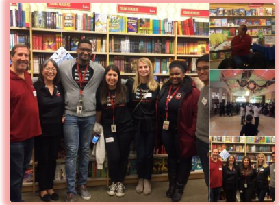
Staff and Students enjoyed storytelling and performances during the CMS Book Fair at B&N!