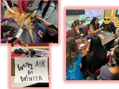
Student groups like HEAL and programs in our Panther Pause space help bring balance to our work!