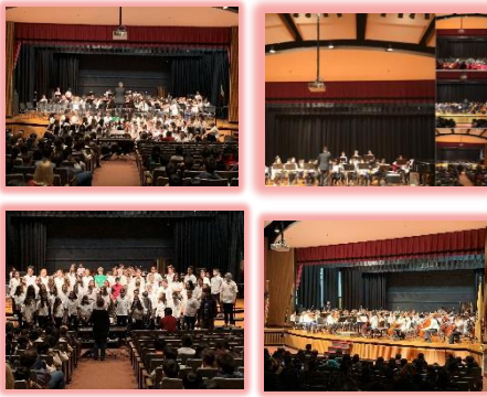
CMS Band, Orchestra, and Choir students performed in their ensemble groups throughout December and January!