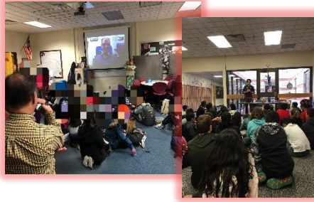
Students hear from experts in the field, including archaeologists and scientists, to make their learning real!