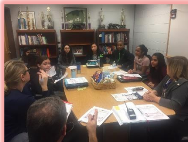
The CMS Youth Advisory Committee met with Sodexo Food Services to discuss the cafeteria.