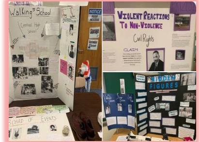
7 th grade students created a Civil Rights Museum for all of TEAM COMMUNITY to visit!