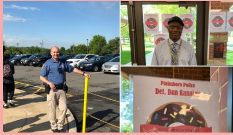
We recognized our Class III Officer, Juvenile Detective, and Eyes on Door Officers for Officer Appreciation Day!