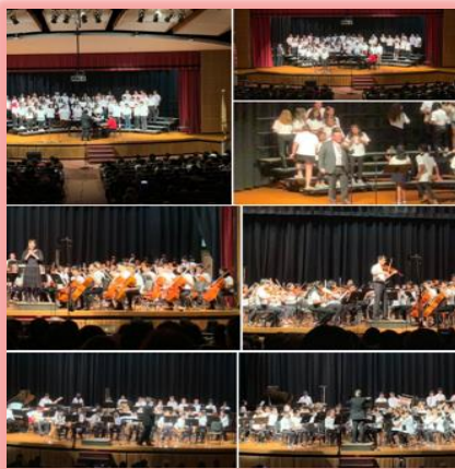
Our Band, Orchestra, and Choir students put on their final performances of the year!