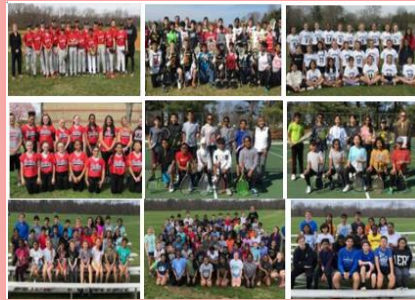
Congratulations to all of our spring athletes for successful, fun seasons!