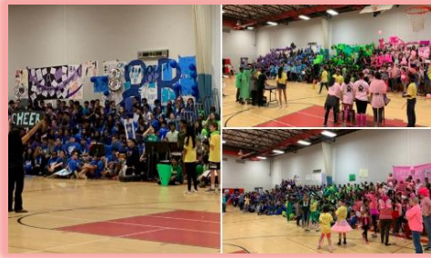
Students in all grades went into Spring Break off of an incredible series of Color Wars Pep Rallies!