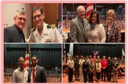
Service men and women were remembered and celebrated during our Memorial Day Assembly.