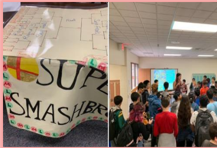
Students helped raise money for our sister school in the Democratic Republic of the Congo with a Super Smash Brothers tournament.