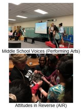
Middle School Voices (Performing Arts)