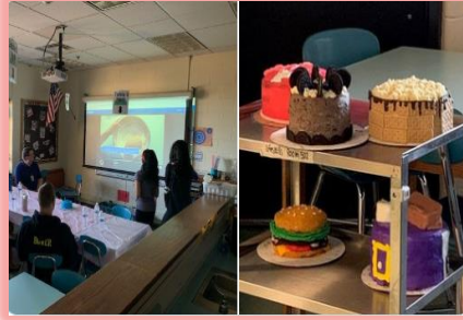
Students in Creative Baking classes showed off their skills during Cake Wars.