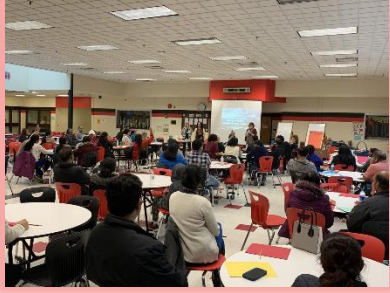
The CMS counseling team hosted over 130 families for a workshop on "lighting the way" for our children.

The weather has warmed up, and as the calendar turns to June we see that the summer is right around the corner! With 3 weeks of school remaining , we continue to work as hard as ever to provide positive middle school experiences for our students. Be on the lookout for plenty of information related to year-end activities for all grade levels! We look forward to coming together to celebrate our year in the middle, and we thank you for being a part of this journey . As always, our Daily Announcements can help you stay aware of all of the latest and greatest at CMS . Enjoy the highlights below, which are just a small sample of what CommUNITY offers. Thanks for your support , and for being a part of our school community.