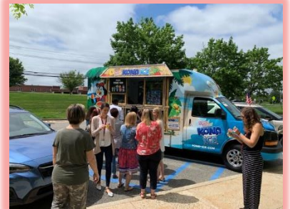
The CMS Staff was treated to something cool to celebration Teacher Appreciation Week.