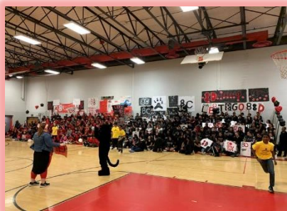
TEAM COMMUNITY students and staff had a blast at our end-of-2019 Pep Rallies!