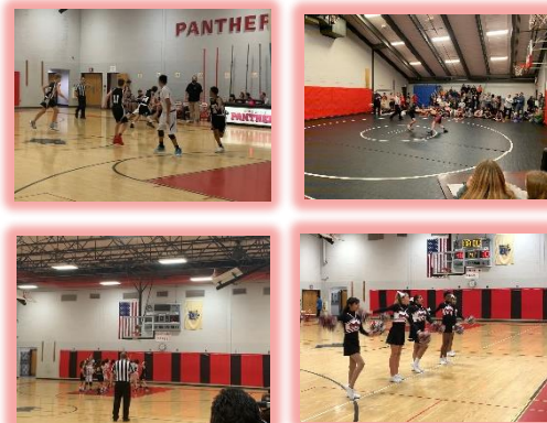
Congratulations to all of our Panther athletes who participated in Winter Athletics!