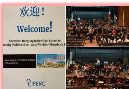
CMS welcomed and hosted students from Shenzhen Hongling Junior High School in China.