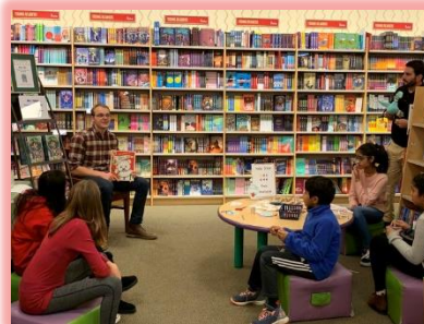
As a part of our Barnes & Noble Book Fair, staff read favorite stories to children!