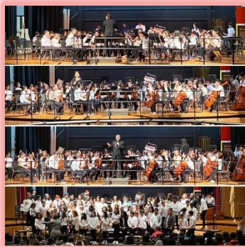
All of our instrumental and vocal ensembles had successful winter concerts.