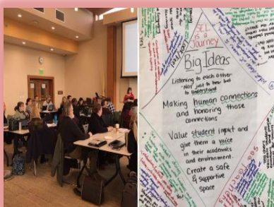
CMS staff continue to explore district strategic goals and apply strategies to their classrooms.