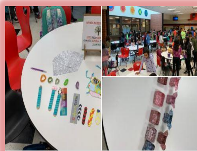
Students designed a marketplace to raise funds for our sister school in Democratic Republic of Congo!