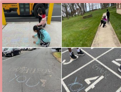
Students spread messages of kindness and positivity inside and outside of CMS!