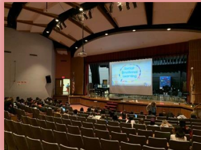
Social Emotional Learning is being integrated into the work we do at TEAM COMMUNITY!

It is hard to imagine that the T.E.A.M. COMMUNITY school year is half-way complete! Students and teachers are working hard to transition to Marking Period 3 . There have been dances and assemblies, unique learning opportunities and trips, and continued work on being our best selves . We are reminded that middle school is truly a journey , and comfort on this journey can be found in our motto We Got This! We hope you and your family have had a great start to the New Year . We look forward to continuing to serve you and your students! Be sure to use our Daily Announcements to stay aware of all upcoming activities for students, school-based events, and more! Below, please enjoy some snapshots from the end of 2019 and start of 2020.