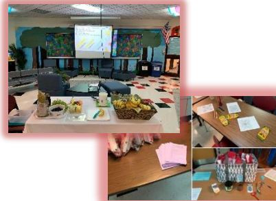
Students and staff continue to use the Panther Pause to take time and learn more about wellness strategies!